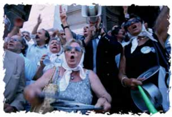
'Get rid of them all!' After the economic crisis in Argentina 2001, there has been huge distrust of banks and the IFIs

The number of state-owned enterprises that have been sold in Mexico since 1983