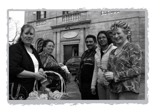
Kankuamo in Pavee point.

LASC has lots of opportunities for volunteers and has campaign groups which you can join. Contact the Volunteer Officer at LASC for further information.